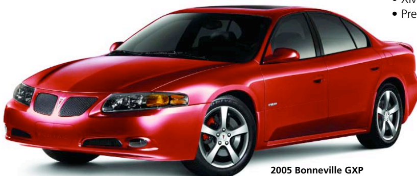
2005 Bonneville GXP

*Service fees apply. Available in the 48 contiguous states. Visit gm.xradio.com .