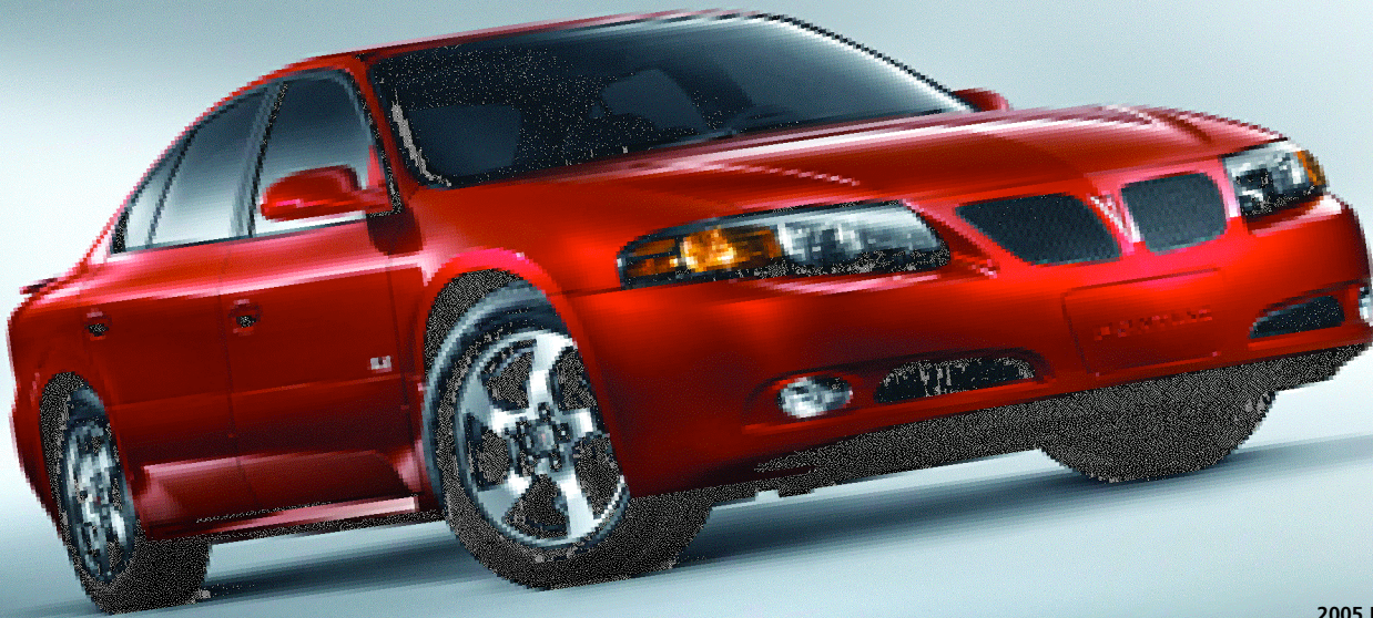
2005 Bonneville SLE